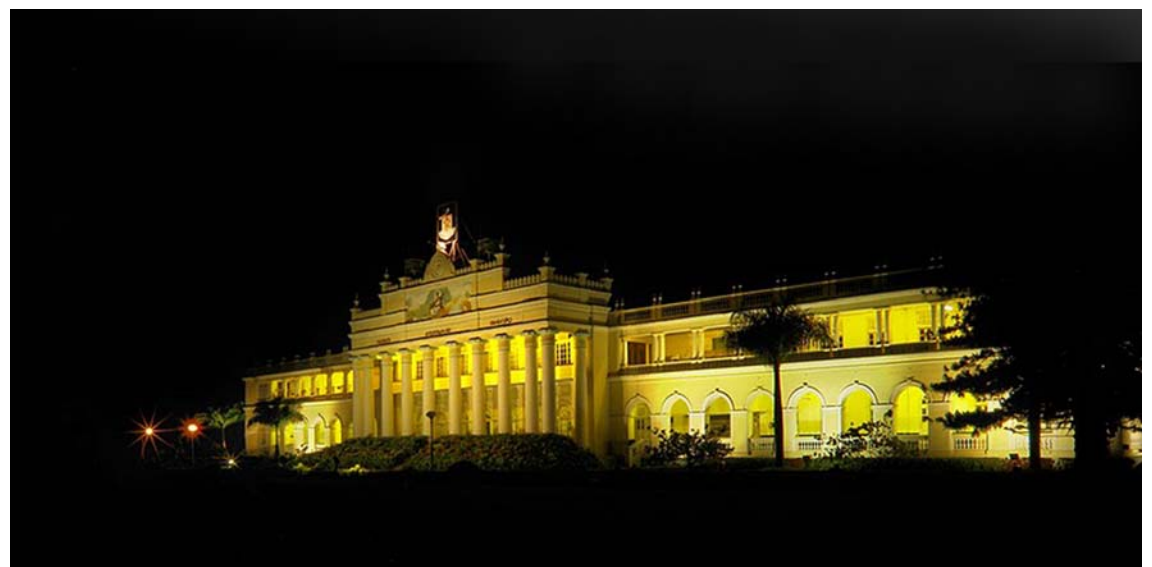
Crawford Hall, University of Mysore - The host of South Zone Vice-Chancellors' Conference