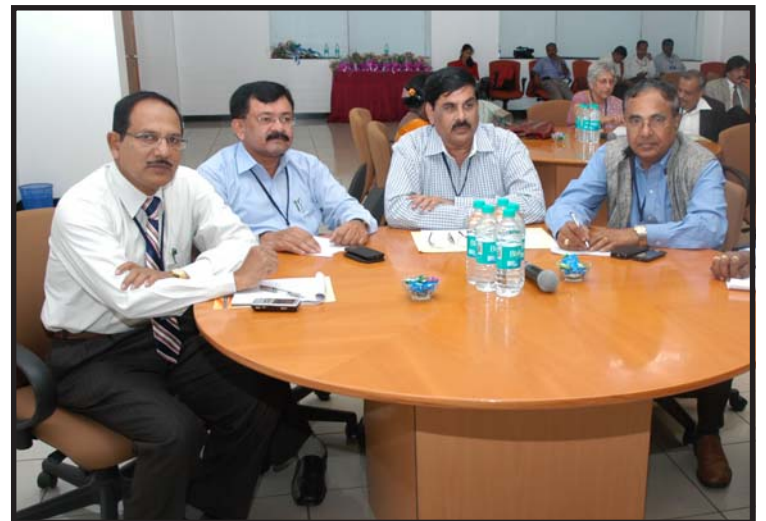
Delegates at South Zone Vice-Chancellors' Conference