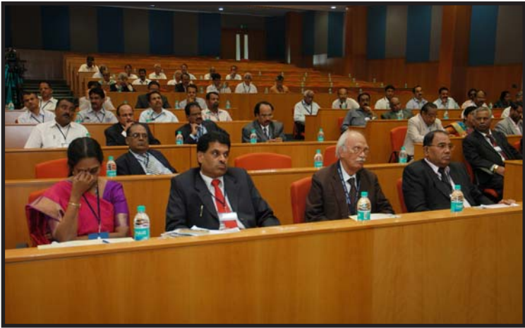
Vice - Chancellors at the South Zone Conference Inaugural Session

The Association of Indian Universities (AIU) established in