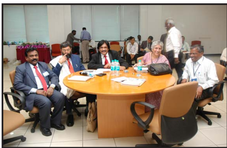
Delegates and office bearers of AIU at the session

students, physical infrastructure available, political interference, funds available, and the in-built mechanism through which the freedom they enjoy has lead to a lot of confusion and contradictions that has resulted the overriding theme for the South Zone Vice Chancellors conference “Diversity in Higher Education Institutions: Future Challenges” which is being held since yesterday in an ambience par excellence – befittingly called