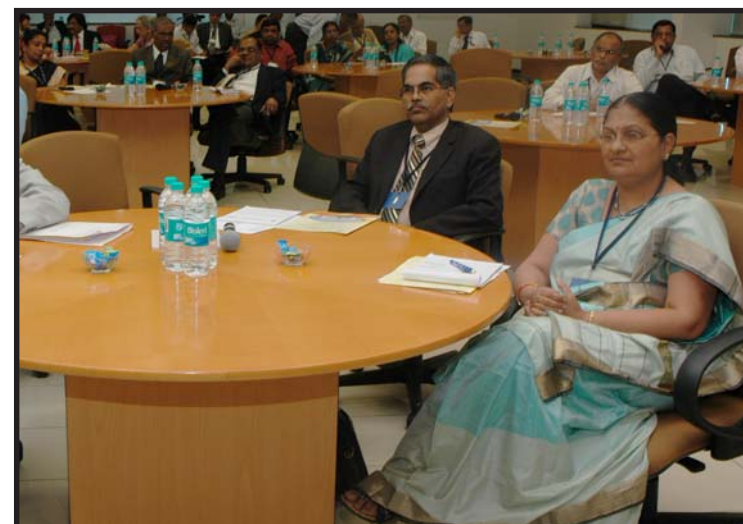
Delegates at the session of South Zone Vice-Chancellors' Conference